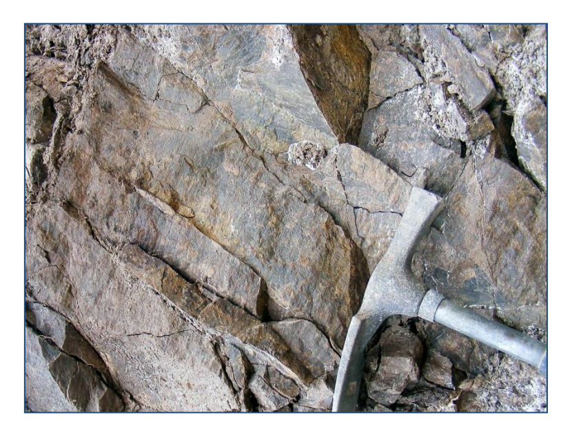
Fig. 3: Detail view of the wall of the R-V trench with exposed Permian siltstones with slickensides and oblique striations on the divisional planes. Photo I. Prachař, 2009.

Basin near Borek, where the Cretaceous sediments cross the line of the Hluboká fault towards the north.