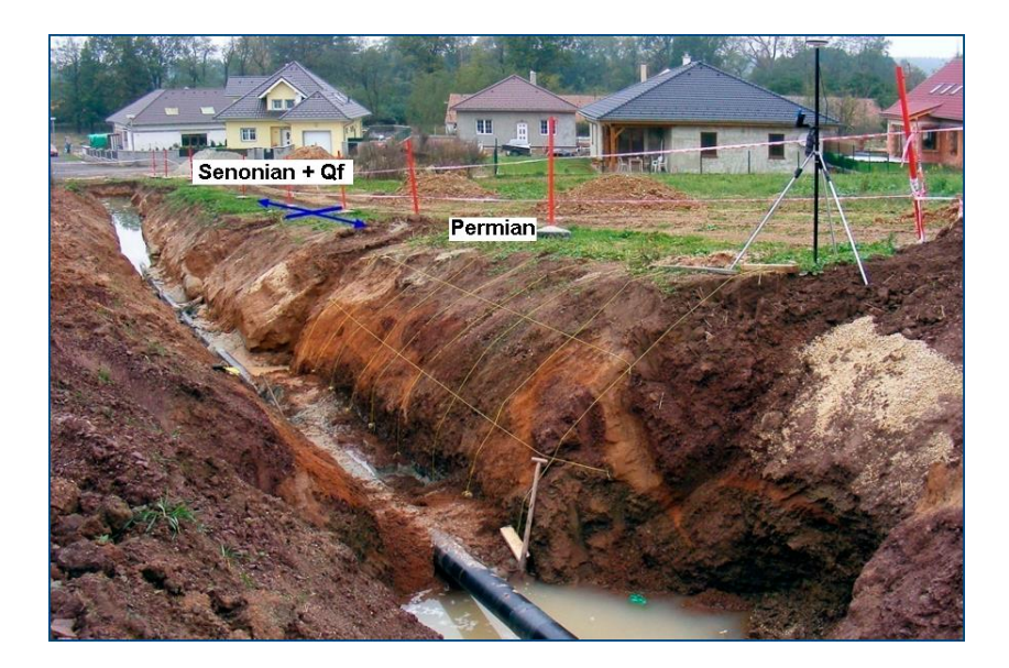
Fig. 2: View of the western end of the water pipe excavation south of the village of Úsilné. The contact between the Senonian sediments of the Budějovice Basin and the Permian sediments of the Lhotice Basin was uncovered by the trench. Senonian sediments and contact are covered by a layer of fluvial sands and slope sediments affected by gelifluction. Photo I. Prachař, 2009.

The contact between the Permian and Cretaceous sediments was investigated in the R-V trench for waterpipe about 700 m long on the southern edge of Úsilné (see Fig. 2), approximately at the point where the Drahotěšice fault is drawn on the geological maps.